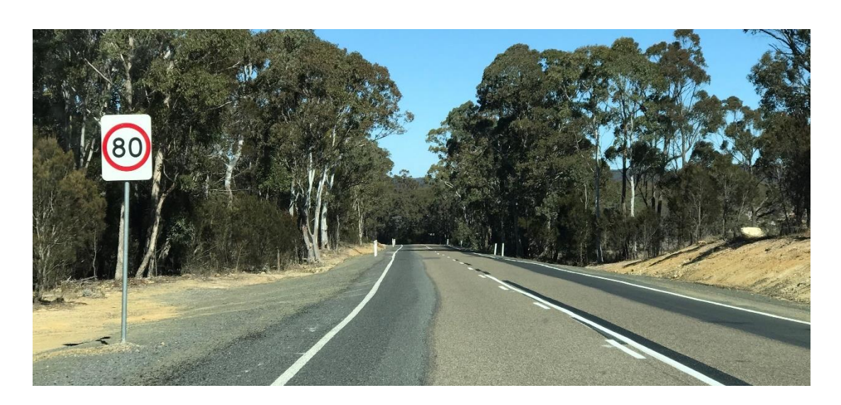
Ref. 17126 RSA Existing Road