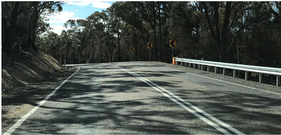
<u>Item 5</u> Edgeline missing on southbound carriageway of Water Course Crossing