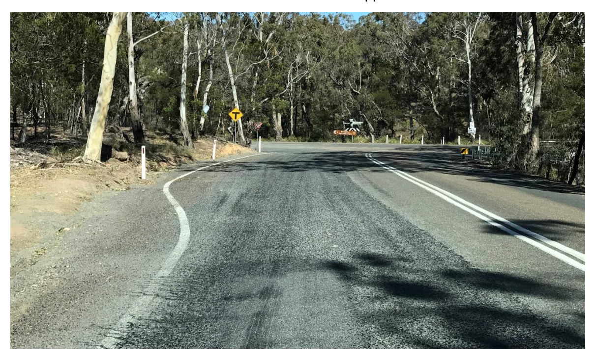
Consider providing chevron alignment markers on curve in road alignment and replacing existing warning signage

Vehicle skid marks were observed on the southbound approach of the intersection