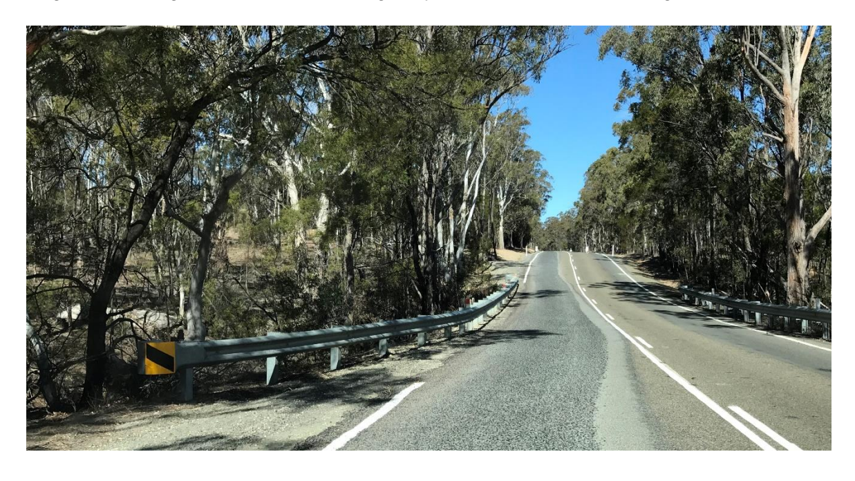
Item 8 Supplementary Speed Advisory signs below warning signs have been twisted and are not visible to approaching vehicles

Edgeline missing on southbound carriageway of Water Course Crossings