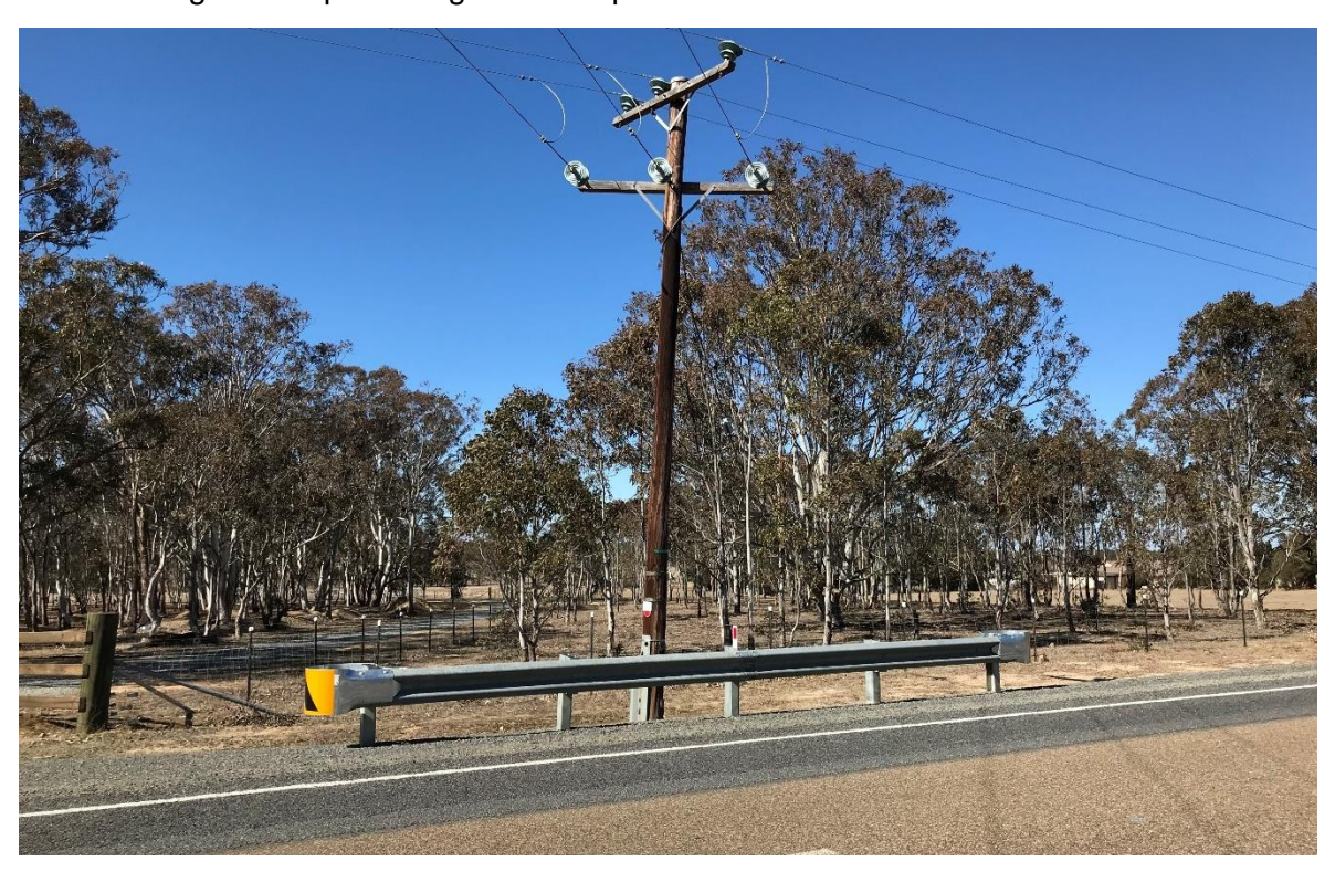
<u>Item 2</u> Sections of guardrail protecting electrical poles in the clear zone