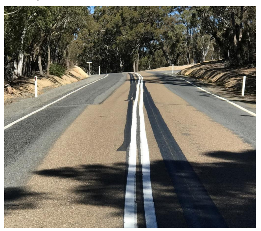
Blacking out of redundant centerline markings is not effective with sunlight reflection

Blacking out of redundant centerline markings is not effective and confusing when crossing over new centerline markings